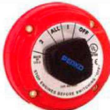
8501 & 8503

For use with 12, 24 & 32 Volt Marine Electrical systems. Capacity : 250 Amps continuous, 360 Amps Intermittent